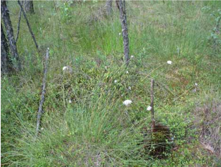
Figure 4: Dwarf shrubs and bog cotton of mires.