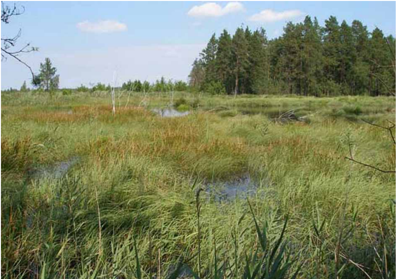
Figure 6: Bog around the river Zholobnytsya: likely breeding site of Nehalennia speciosa .

N. speciosa is a rare and declining species in Europe and in need of strong protection (Bernard & Wildermuth 2005). Old records were known for Ukraine from the beginning of the 20th century, mainly in the north and western parts and one record from the south (Gorb et al. 2000). Since 1950 only individual specimens were found in northern Ukraine (Volynska and Chernihiv oblast') and some data need confirmation (Bernard & Wildermuth 2005).