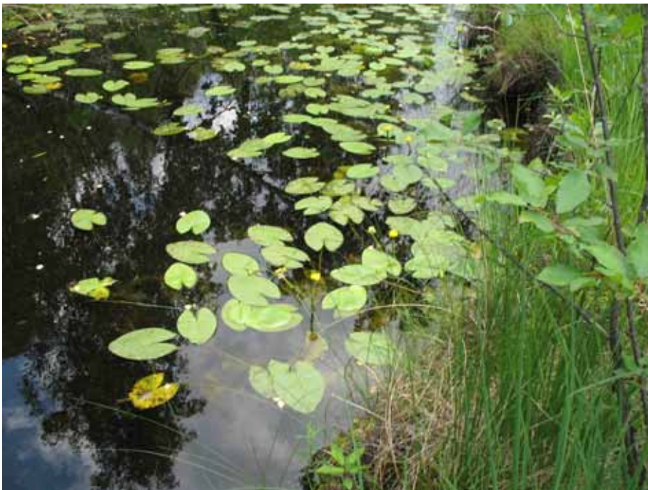
Figure 5: Emergent and floating vegetation in rivers.