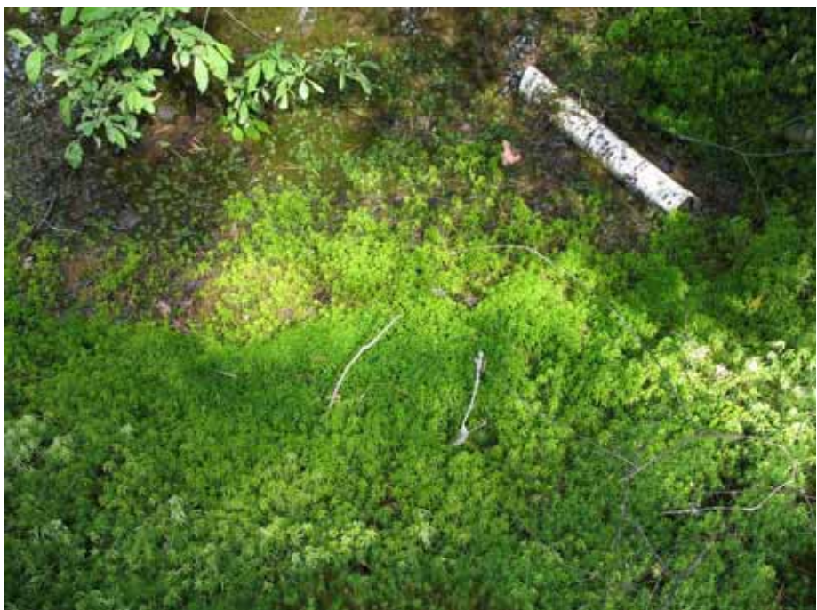
Figure 3: Sphagnum bog.

Vaccinium myrtillus , a considerable part of the mires is overgrown with Betula pubescens and Alnus glutinosa , occasionally with Populus tremula , Pinus sylvestris (Fig. 2), or green and Sphagnum mosses (Fig. 3), bushes of Salix lapponum , S. myrtilloides and S. rosmarinifolia . In some places Oxycoccus palustris and cotton-grass Eriophorum vaginatum occur (Fig. 4). Plant communities mainly consisting of Nymphaea candida and Nuphar lutea occur in open water places (Fig. 5).