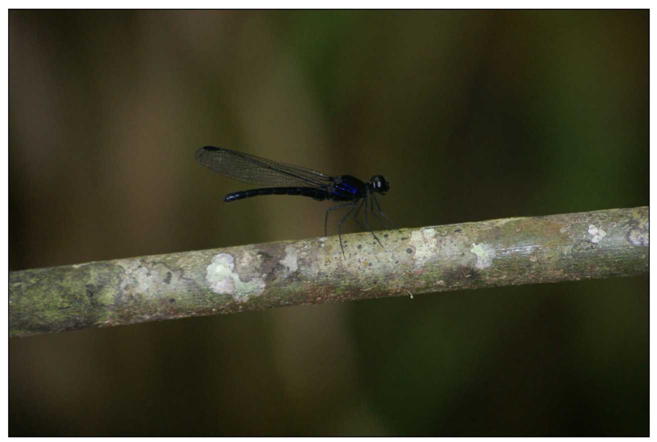
Figure 8: Cyrano unicolor