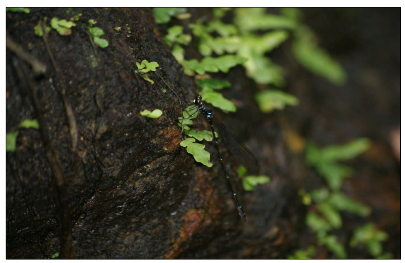
Figure 4: Drepanosticta philippa

2. Drepanosticta sp. n. (B) (Figure 5) This undescribed species is not common but another two young males were