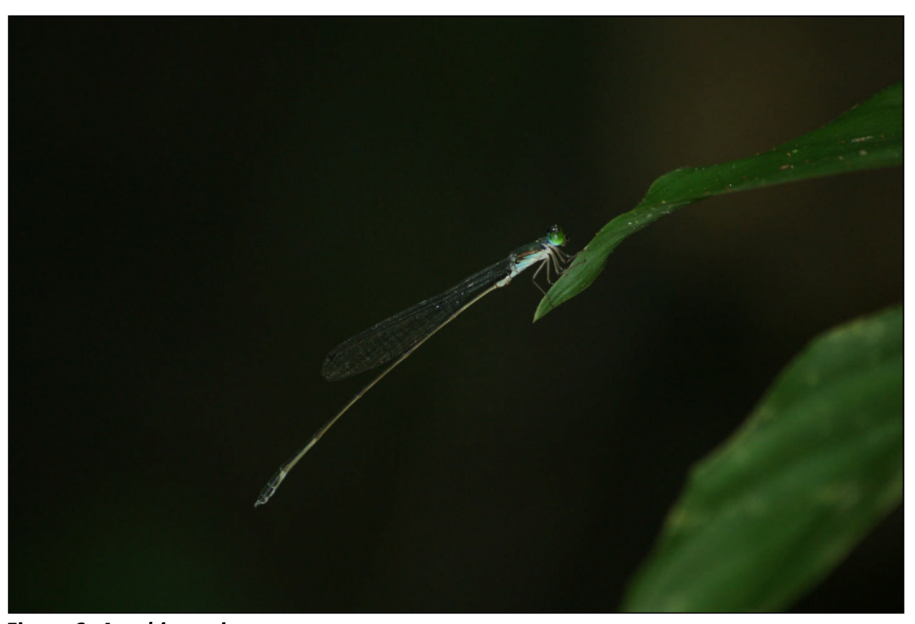
Figure 6: Amphicnemis sp.n.

A single female was found. The prothoraxic structure suggests that it represent a distinct new species, and is closely allied to Amphicnemis incallida . However, the absence of male made me refrain from preparing a species description.