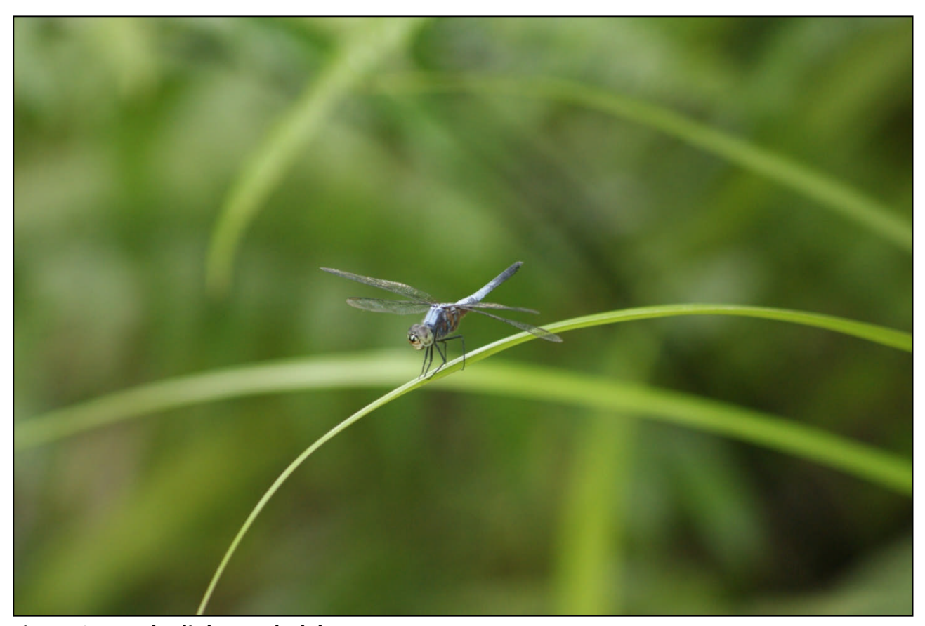
Figure 9: Brachydiplax c. chalybea