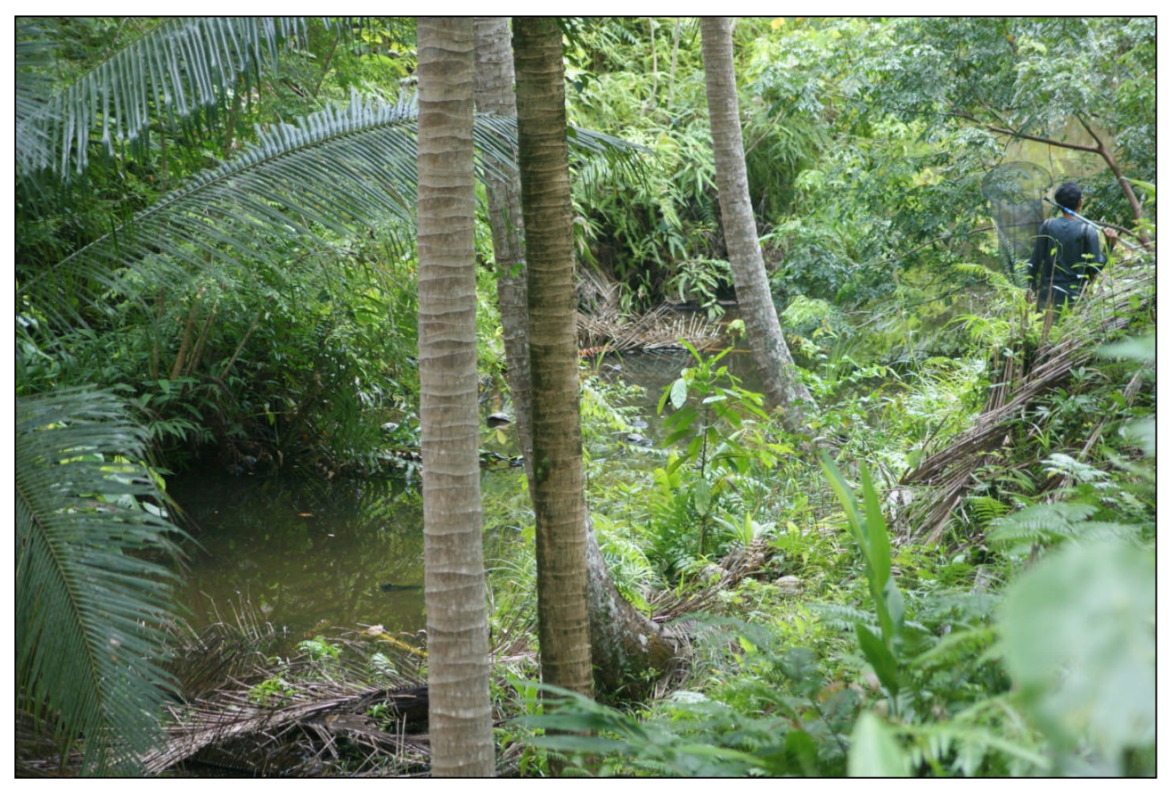
Figure 2: Secondary forest pond