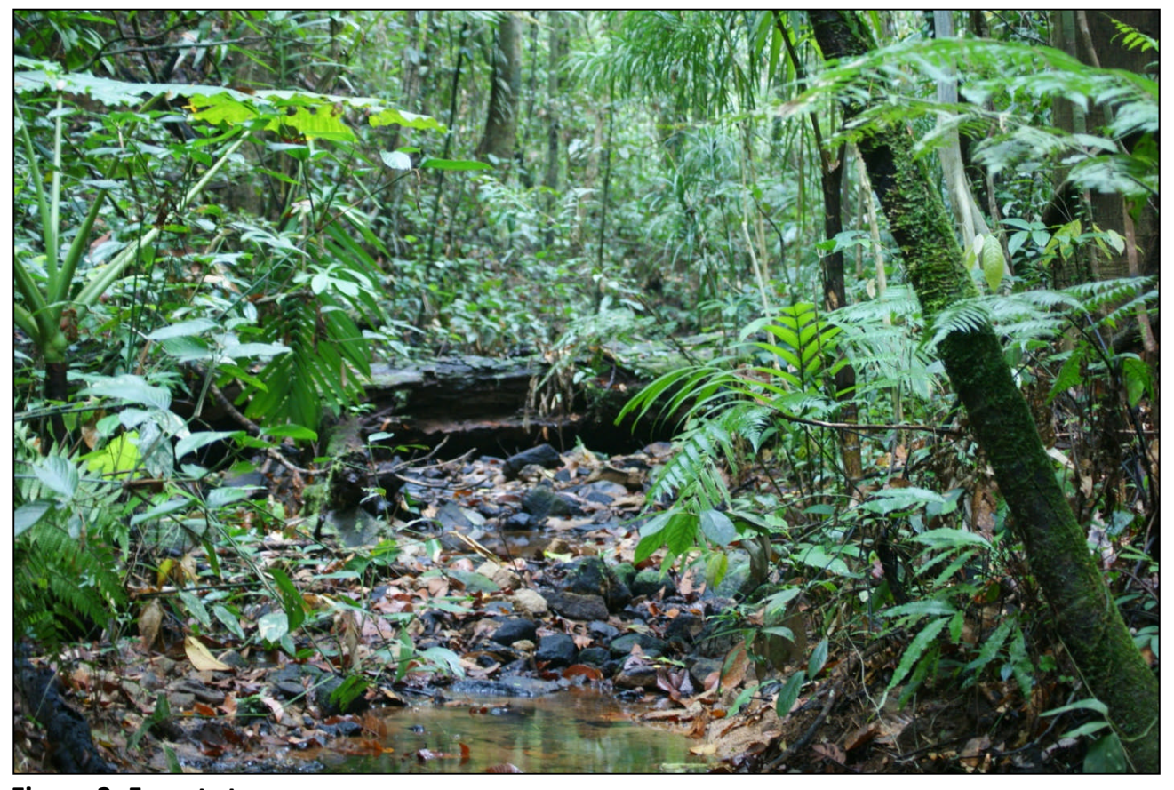
Figure 3: Forest stream