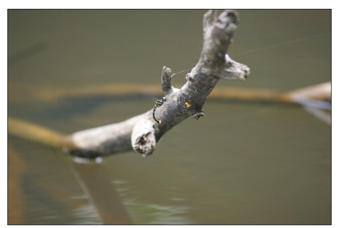
Figure 10: Tetrathemis i. irregularis