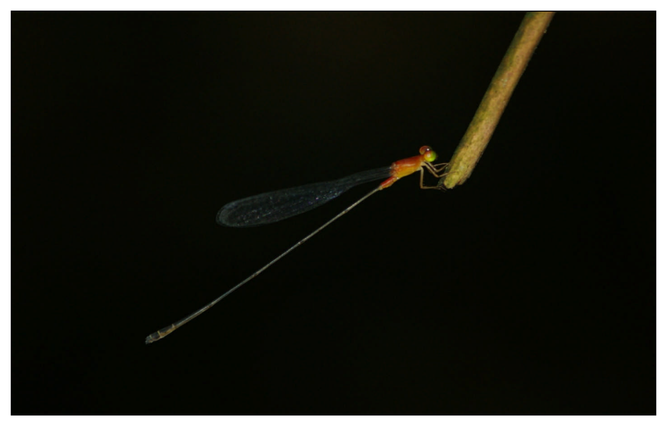
Figure 7: Teinobasis sp. cf. corolla