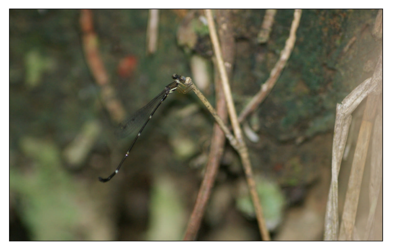
Figure 5: Drepanosticta sp.n.

2. Drepanosticta sp. n. (B) (Figure 5) This undescribed species is not common but another two young males were