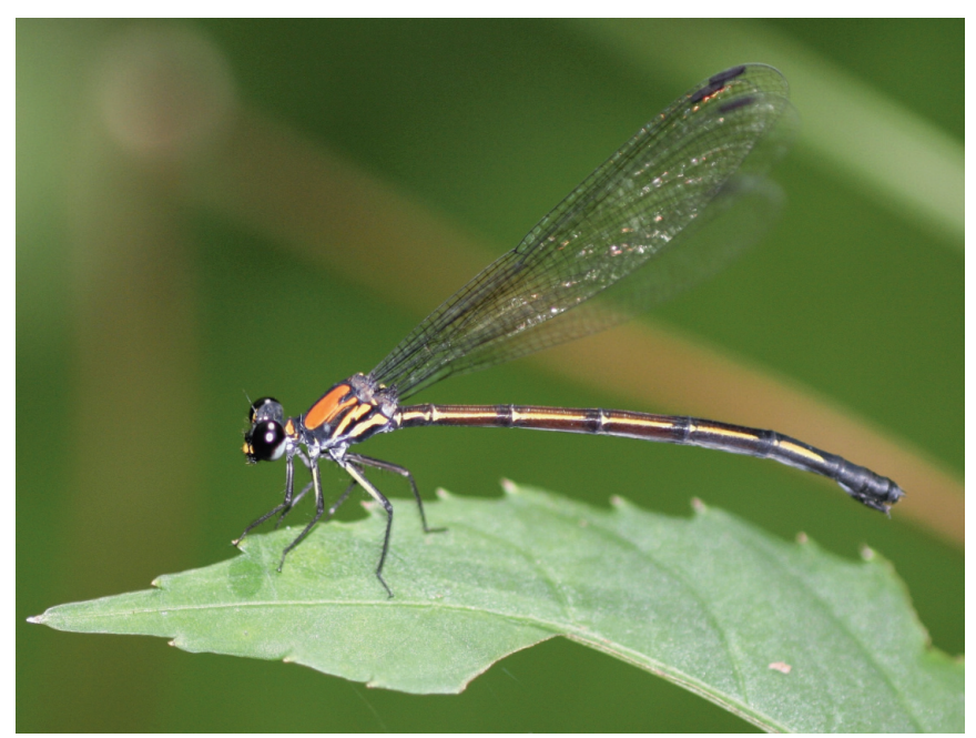
Fig. 33. Cryptophaea vietnamensis female. Vietnam, Vinh Phuc prov.; 26-vi-2005.

be the genitive case of an adjective, but not in connection with a relational noun such as Bayadera in the nominative case, which a genus name always has to be. If the genitive case had been intended it should have been a noun based on the name of the country which would have created the binomial Bayadera vietnamiae .