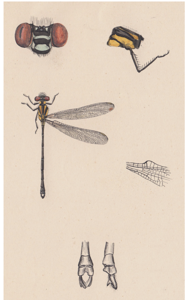
Fig. 3. Illustrations of the holotype male of Anisopleura furcata from Burma in Coll. Selys. Artwork by Guillaume Séverin.

authors naming new species-group taxa before the end of the 19<sup>th</sup> century were: Robert McLachlan (1870, 1880, 1898), W. F. Kirby (1893) and Leopold Krüger (1898). In his 'Synonymic catalogue of Odonata', Kirby (1890) upgraded all Selysian subgenera to the rank of a full genus, and he replaced the genus name Euphaea with a new name Pseudophaea (with Euphaea variegata Rambur as its type species); for details, see entry Pseudophaea . By the year 1900, a total of 39 species-group names had been introduced, and of these 25 names are presently ranked as valid species and one name a valid subspecies. Then, during the next four decades the number of valid described species doubled. In the period from 1902 to 1938 a total of 24 new species were described by a total of 11 authors: René