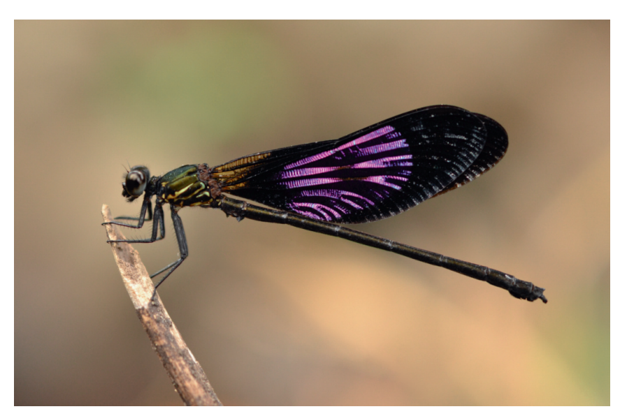
Fig. 8. Euphaea variegata, the type species of the genus Euphaea. Male. Indonesia, Java Island; 19-ix-2013.

Already Rambur (1842: 229) pointed out that Calopteryx holosericea male did not agree with Selys' generic diagnosis, since according to Burmeister's description, the male did