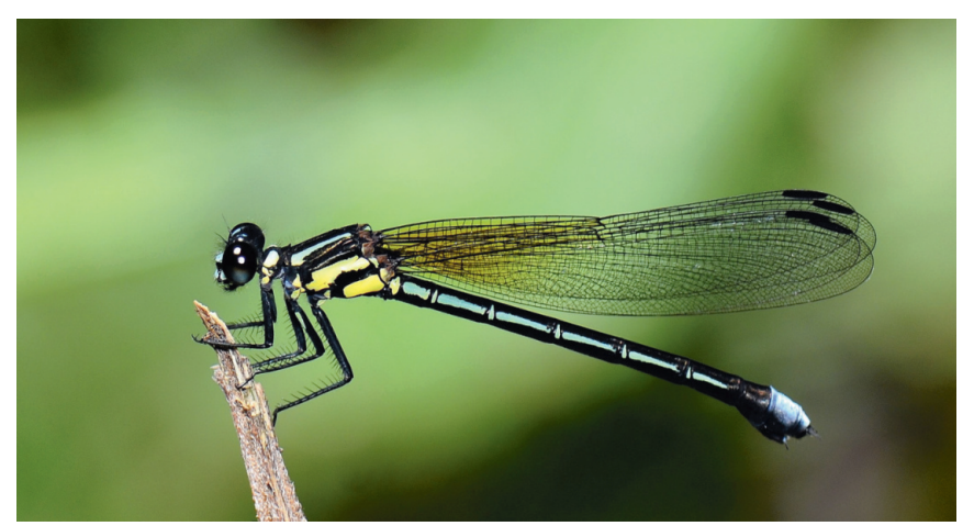
Fig. 26. Anisopleura qingyuanensis female. China, Guizhou prov.; 24-viii-2016.