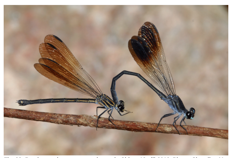
Fig. 23. Baydera melanopteryx tandem pair. China; 12-viii-2012.