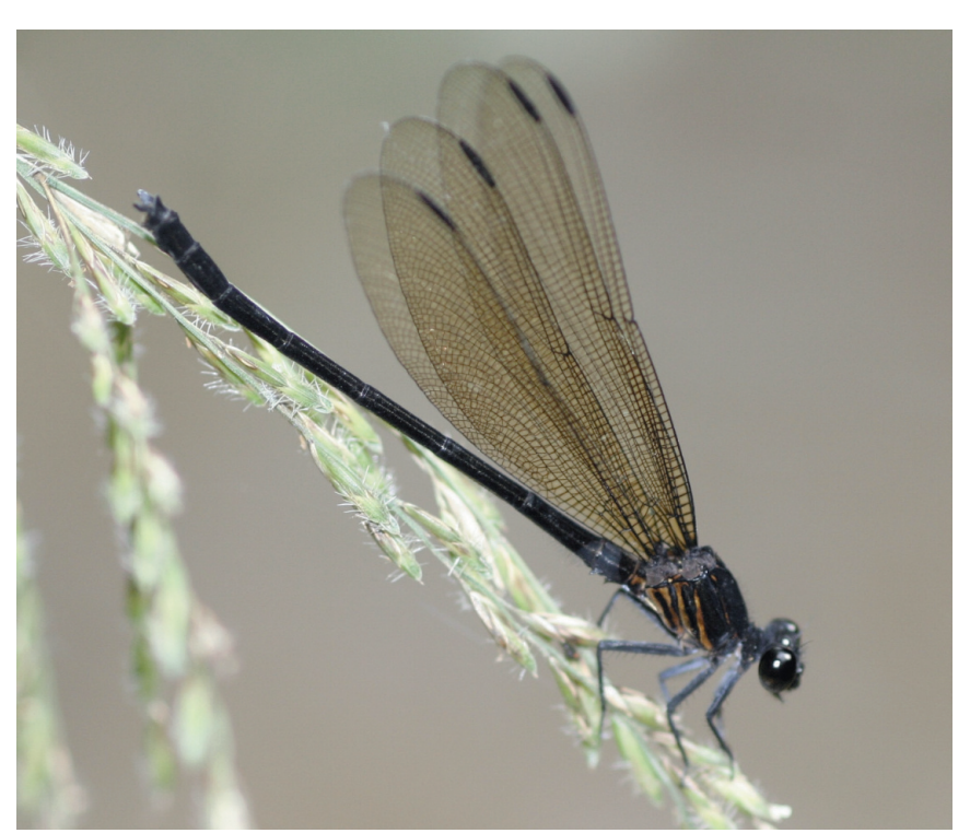
Fig. 25. Euphaea pahyapi male. Thailand, Krabi prov.; 20-xii-2006.