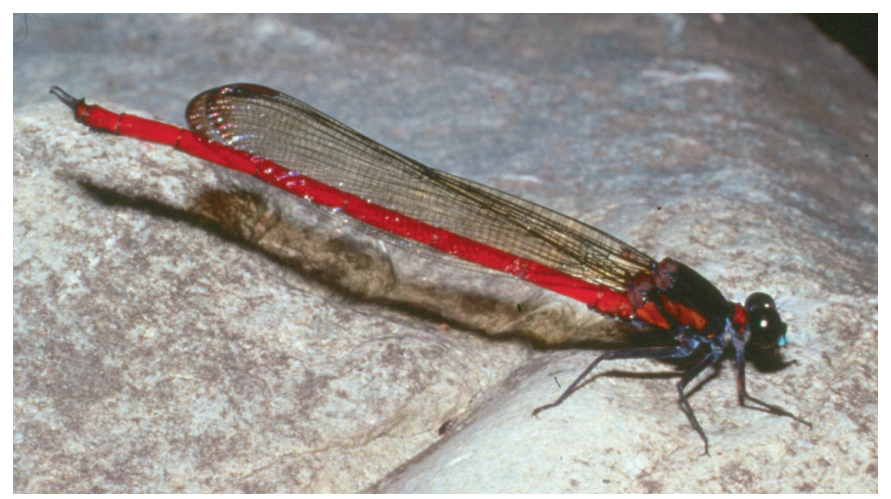
Fig. 10. Heterophaea barbata male. Philippines, Luzon, Aurora prov.; 21-iii-1997.