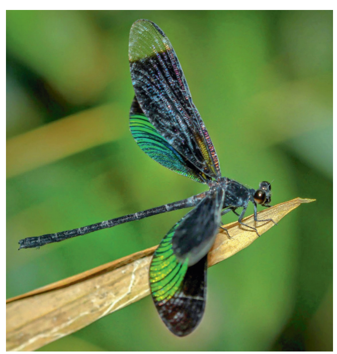
Fig. 19. Euphaea guerini male. Vietnam, Phu To prov.; 12-vii-2014.