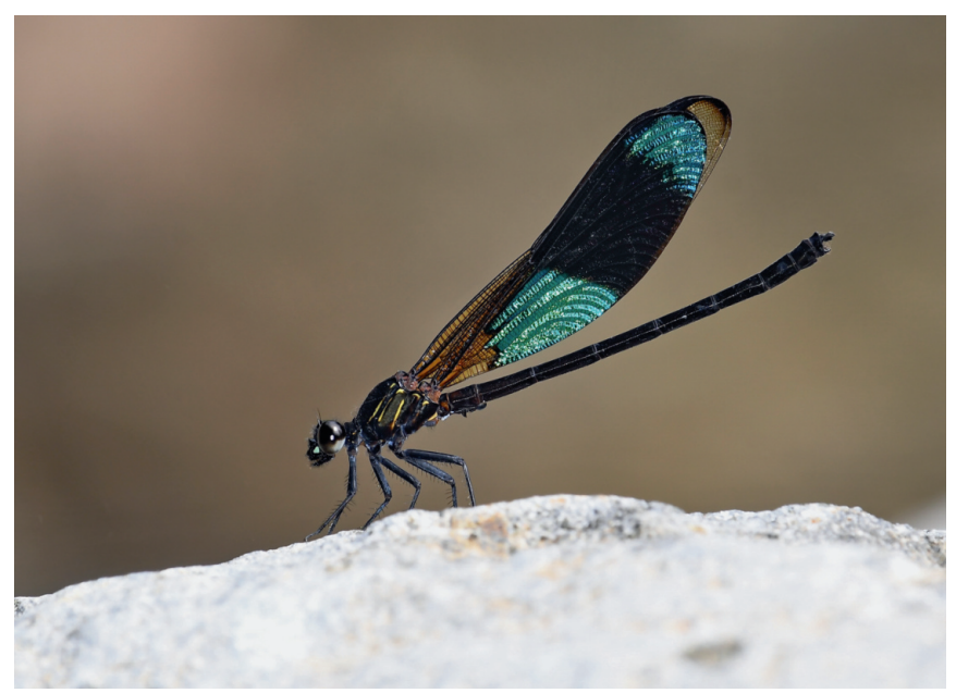
Fig. 9. Euphaea amphicyana male. Philippines, Biliran Island; 13-i-2022.

Ris placed the new species from Mindanao into the 'Euphaea tricolor-group' (including four species from Borneo: tricolor, subcostalis, subnodalis and basalis). In these species, the darkly coloured areas of the hind wings have zones of blue-green metallic reflections, the arrangement and extent of which varies between the species. For E. amphicyana they were characterized as follows: "Die dunkle Farbe beginnt etwa am distalen Ende des Vierecks, oder subhyalin schon an der Basis. Hyalin oder subhyalin 3,5, dunkel 24,5 mm. Darin auf der U{nter}seite blaumetallisch bis zum Nodus an der Costa, 4-5 Zellen weiter distal am analen Rand, schwarz bis zum Pterostigma, blau die Flügelspitze. Auf der O{ber}seite blau bis zur Mitte Nodus-Pterostigma, distal mit diffusem Abschluss, schwarz der Rest ohne blaue Spitze [The dark colour begins about the distal end of the quadrilateral, or partially hyaline at the base. The hyaline or subhyaline areas are 3.5, dark coloured 24.5 mm. Within that {area} on the underside blue metallic to the nodus, at the costa, 4 to 5 cells farther distally at the anal margin, black up to the pterostigma, the apex blue. On the upper side