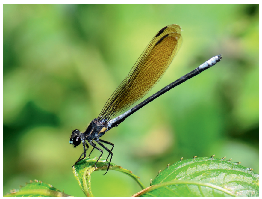
Fig. 12. Bayadera continentalis male. China, Guangxi prov.; 5-vi-2017.

The holotype male was collected in Fujian – "Kuatun, {alt.} 2300 m. Fukien" – by Johann Friedrich Klapperich (1913-1987) on 1 May 1938 [not on 1 May 1946, as stated by Asahina]. Klapperich also collected many (104 \sigma , 70 \circ ) other specimens from the same location, some of which were listed as paratypes. The holotype is deposited in the NSMT (Tokyo). Reference. Asahina (1973: 455).