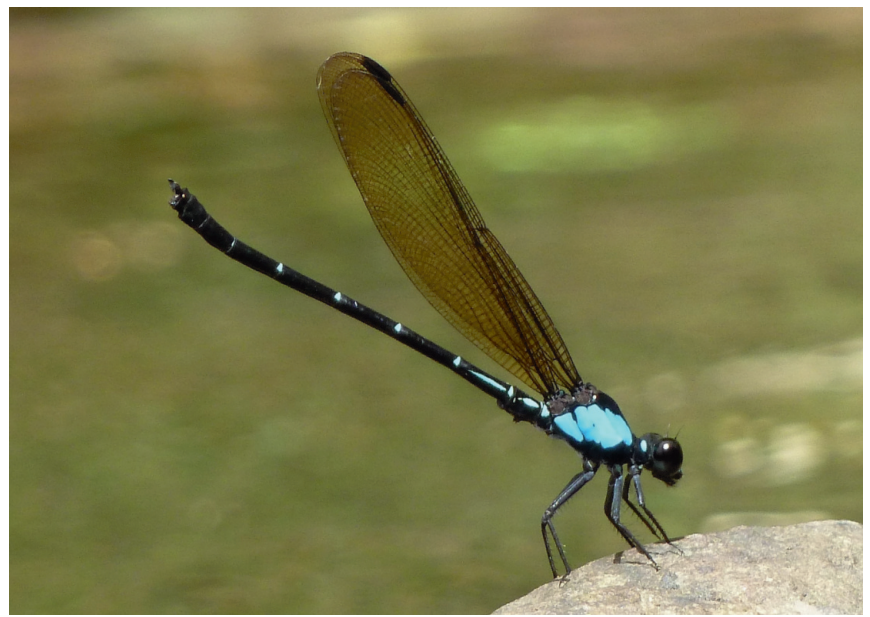
Fig. 13. Euphaea cora male. Philippines, Mindanao, Surigao del Sur prov.; 27-x-2011.