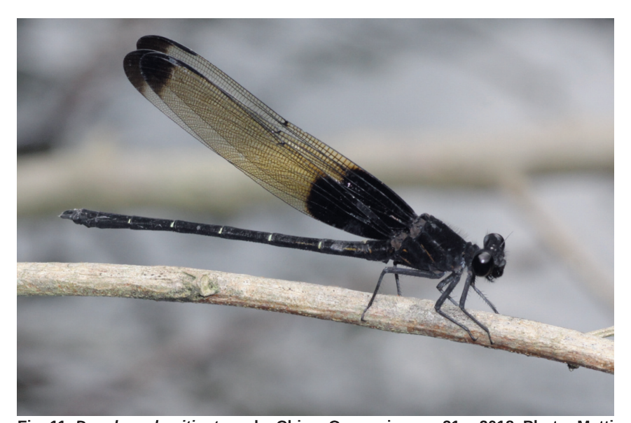
Fig. 11. Dysphaea basitincta male. China, Guangxi prov.; 31-v-2018.