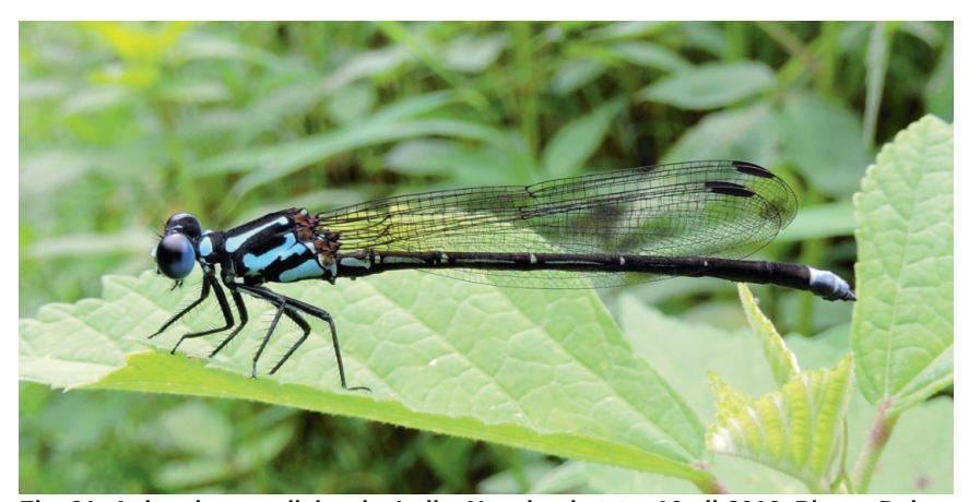
Fig. 31. Anisopleura vallei male. India, Nagaland state; 16-vii-2016.

Described on the basis of 9 male specimens from "Cherapunji, Khasi Hills, Assam. Juni 1935." [Khasia Hills, Meghalaya, India]. The holotype is deposited in the NHMV (Vienna). Reference . St. Quentin (1937: 86).