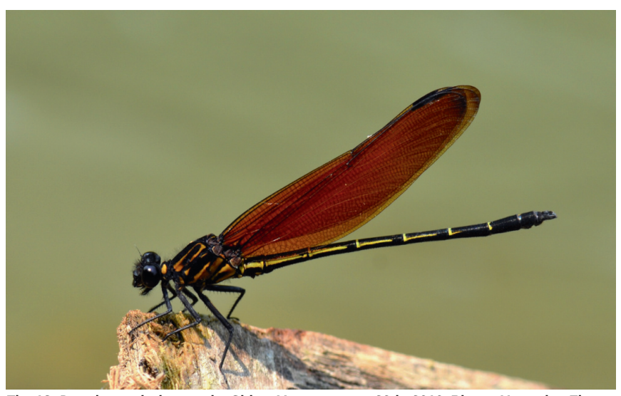
Fig. 18. Dysphaea gloriosa male. China, Yunnan prov.; 29-iv-2010.