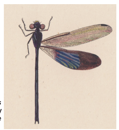
Fig. 5. Illustration of Euphaea subcostalis male from Borneo in Coll. Selys. Artwork by Guillaume Séverin. (© Royal Belgian Institute of Natural Sciences, Brussels).