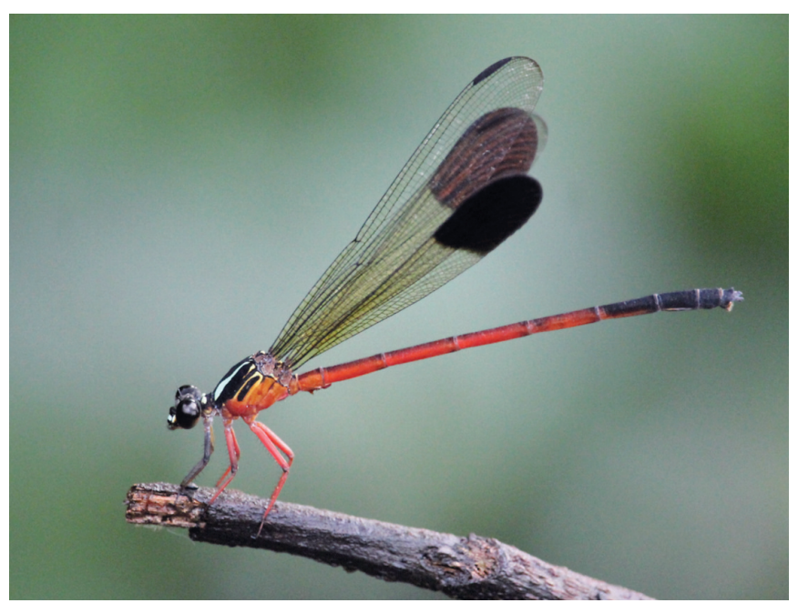
Fig. 16. Euphaea fraseri male. India, Kerala state; 22.vi.2020.

Wells Kemp (1882-1945) in October 1916. The holotype male was deposited in the Indian Museum (Kolkata).