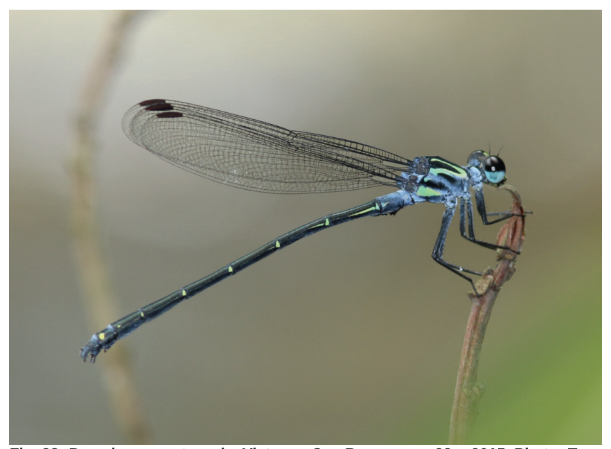
Fig. 28. Bayadera serrata male. Vietnam, Cao Bang prov.; 23-v-2015.

The authors explain their choice of name as follows: "Etymology. – serrata, Latin serrule {sic} = a saw, adjective serrated, referring to the inferior margins of the apices of the superior