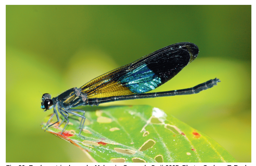
Fig. 30. Euphaea tricolor male. Malaysia, Sarawak; 5-xii-2005.

The name 'three-coloured' refers to the colour pattern of the male hind wing, in which the basal half is amber tinged hyaline and the opaque apical half is sharply divided into brilliant iridescent blue- green and black opaque sections: "Ailes hyalines un peu jaun-