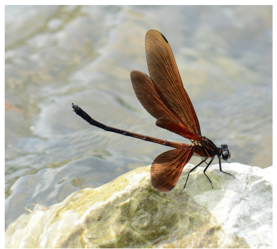
Fig. 29. Euphaea superba male. China, Guizhou prov.; 19-vi-2018.

The name is clearly due to the large size and colourful wings of this damselfly, which Kimmins calls a "handsome species". In the description of the male it reads: "A large golden-brown-winged species, with obscure brown suffusion at the apices of the wings" and "Wings ... hyaline golden-brown, apices with a brownish suffusion, extending in the anterior to about halfway along the pterostigma and in the posterior to a few cells beyond the pterostigma. The colour of the membrane is stronger in the costal and subcostal areas towards the bases of the wings. ... pterostigma dark reddish brown, other veins and cross-veins, particularly when viewed along the plane of the wings, brick red." The author states: "This species differs from the other yellow-winged species in its greater size, denser reticulation, brownish markings at the wing-apices and the smooth surface of the vesicle."