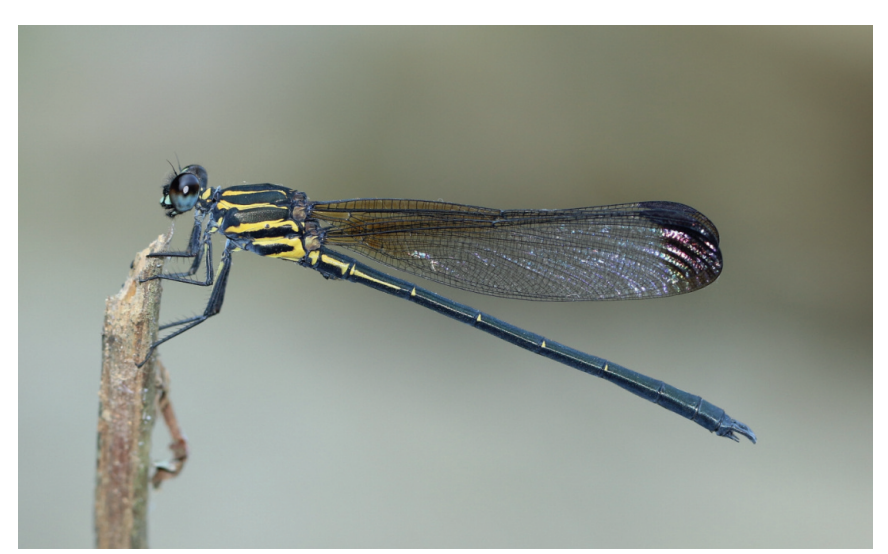
Fig. 20. Bayadera hatvan male. Vietnam, Yen Bai prov.; 11-v-2014.