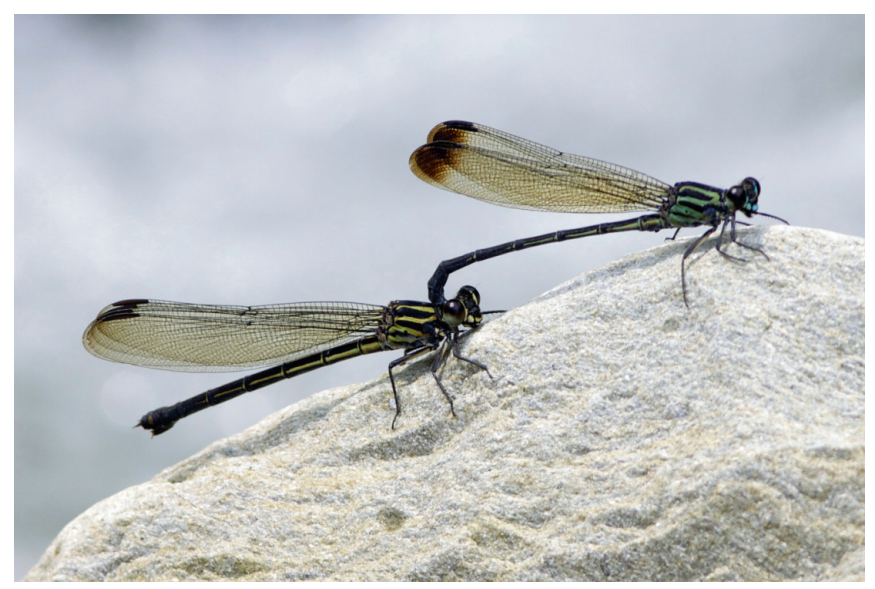
Fig. 22. Bayadera indica tandem pair. Nepal, Bokhara; 11-ix-2013.

A toponym. The species was described from "numerous" male specimens from an unspecified location in India: "Patrie: Inde. Musée britannique; collect. Selys.) (1853)"; "Patrie: