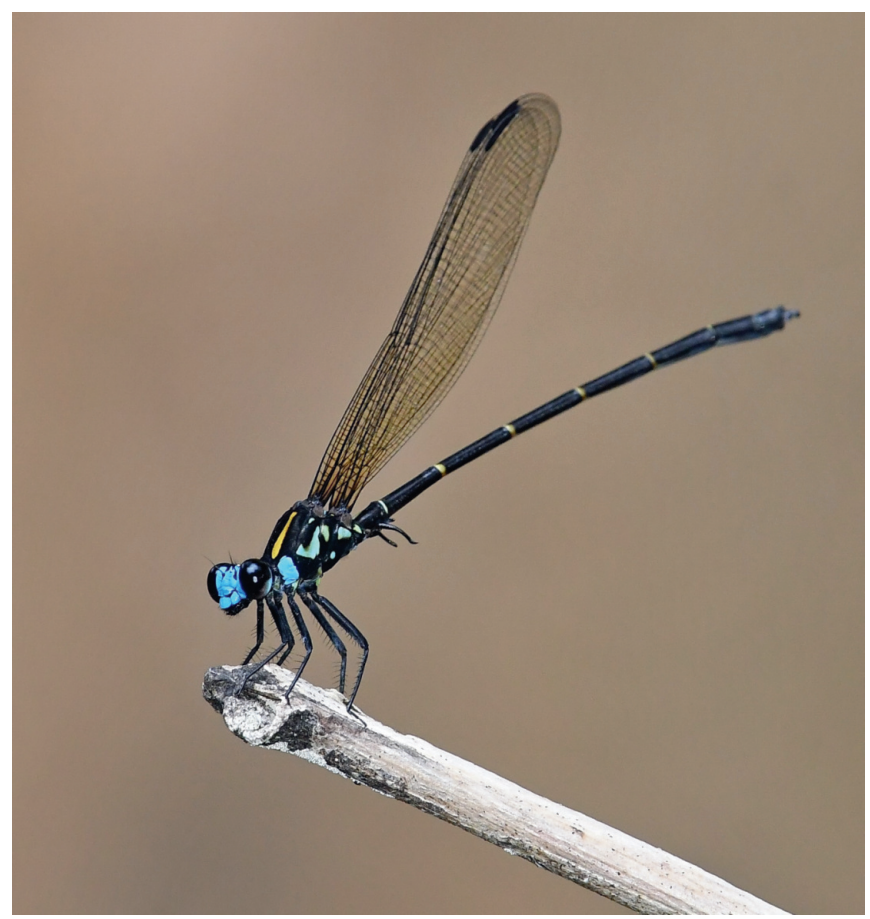
Fig. 14. Cyclophaea cyanifrons male. Philippines, Palawan Island; 25-x-2023.