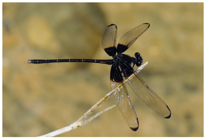
Fig. 32. Dysphaea vanida male. Thailand, Surat Thani prov.; 27-i-2015.