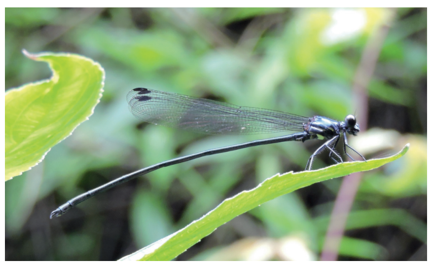
Fig. 27. Schmidtiphaea schmidi male. India, Nagaland state; 25-viii-2016.

The author wrote: "The specific name is dedicated to the collector, Dr. Fernand Schmid." The description was based on a single male specimen from "Huiahu, 3800-5000ft., Manipur, Assam", collected by Schmid on 1 July 1960. The holotype is kept in the NSMT (Tokyo). Reference . Asahina (1978: 44).