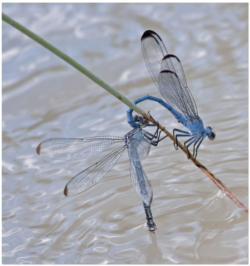
Fig. 15. Epallage fatime tandem pair. Turkey, Adiyaman prov.; 8-vi-2011.