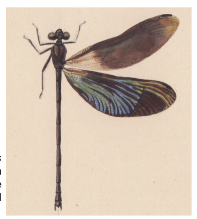
Fig. 6. Illustration of Euphaea splendens [originally as Euphaea carissima] male from Ceylon in Coll. Selys. Artwork by Guillaume Séverin. (© Royal Belgian Institute of Natural Sciences, Brussels).