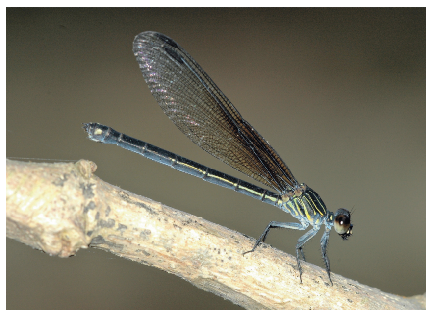
Fig. 24. Euphaea ornata female. China, Hainan Island; 13-viii-2008.

Lat. ornatus —a —um = decorated, adorned / honoured (/ equipped) {declinable adjective} In a paper on Hainanese dragonflies, Kirby (1900: 536) had identified and illustrated a male specimen as 'Pseudophaea decorata (?)', although he suspected that it might be distinct from P. decorata, a species which he had not seen. Campion had studied the same specimen as