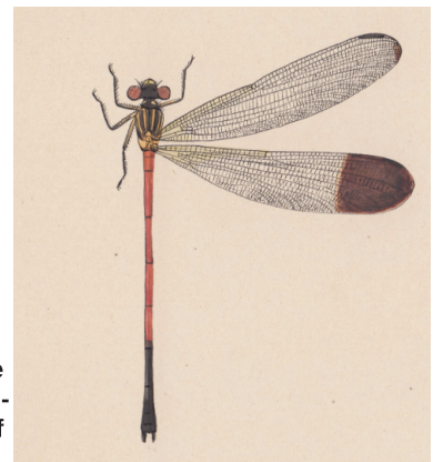
Fig. 4. Illustration of Euphaea dispar male from India in Coll. Selys. Artwork by Guillaume Séverin.