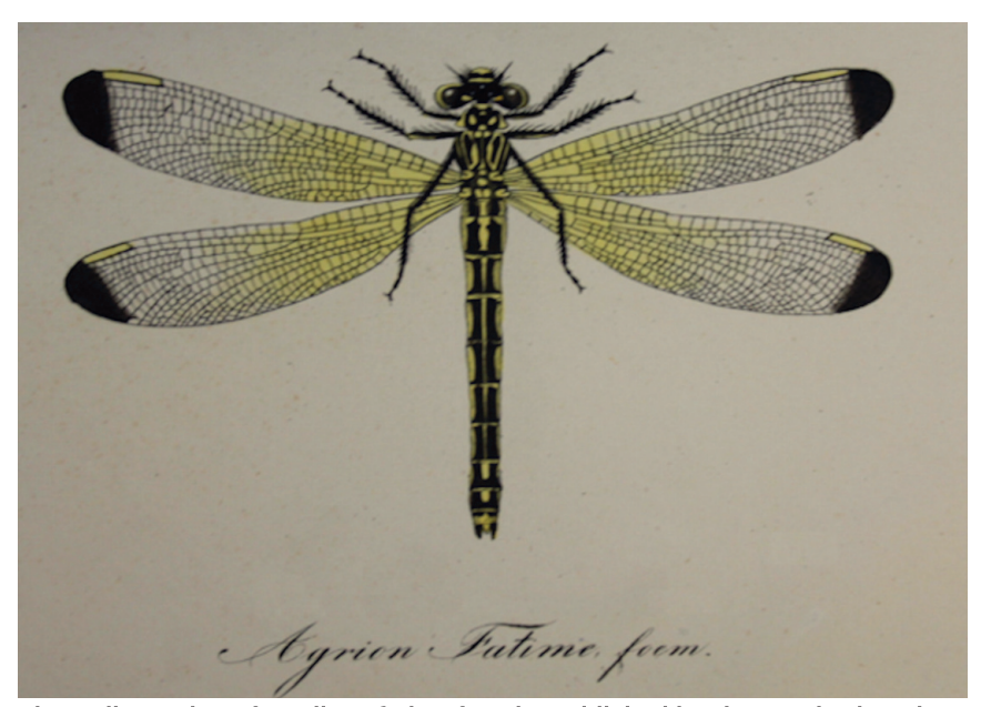
Fig. 2. Illustration of Epallage fatime female, published in Charpentier (1840).